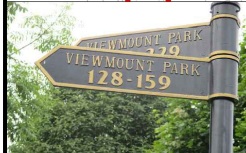
TYPICAL FINGER POST DIRECTIONAL SIGN (CAST IRON OR SIMILAR)